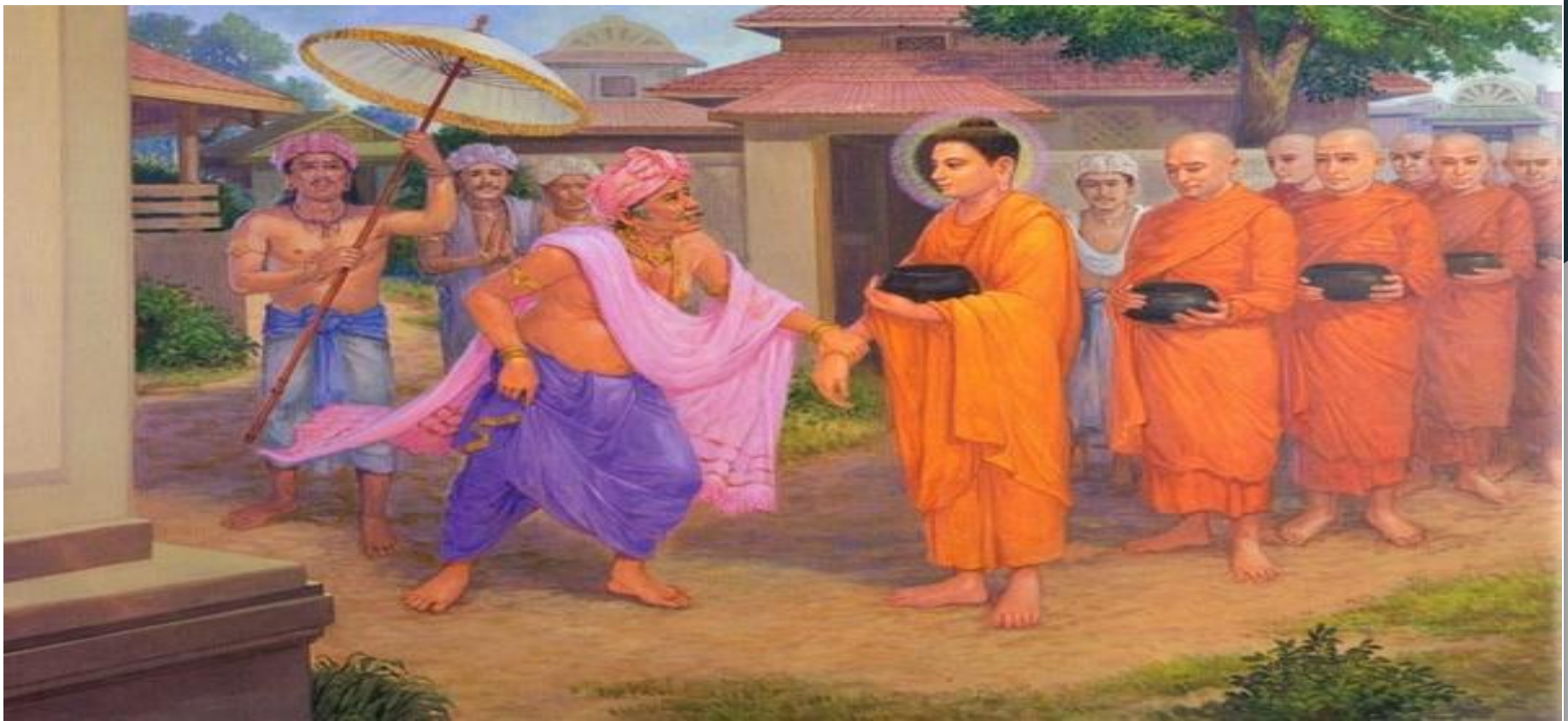
King Siddhodhana asking not go alms round on the road and come to the palace