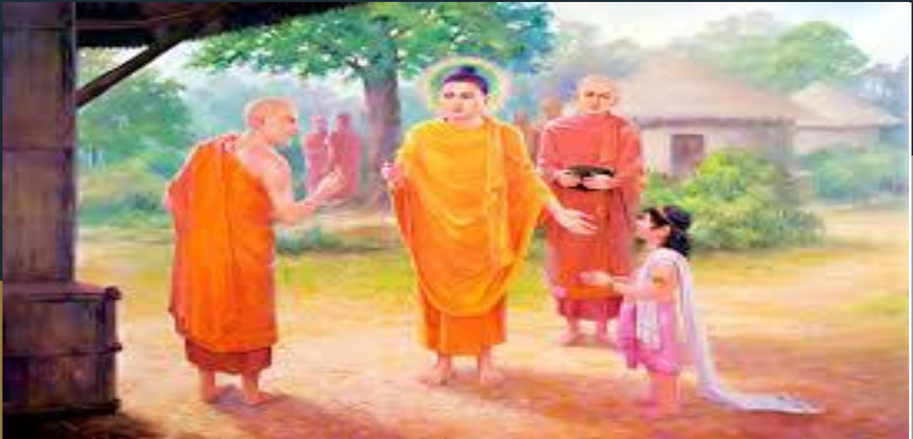
Prince Rahula asking his inheritance from the Buddha