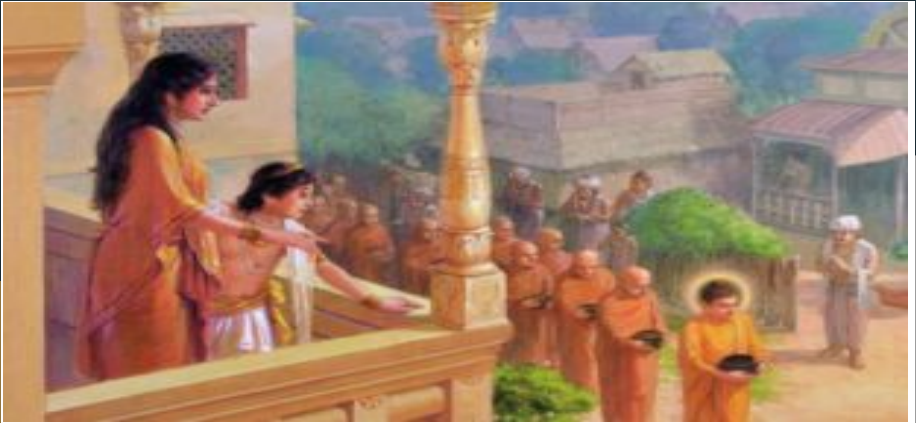
Princess Yashodhara showing his father to prince Rahula